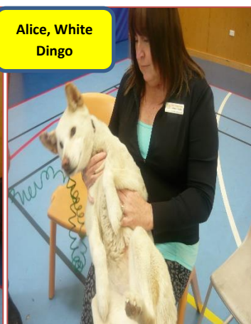
Alice, White Dingo