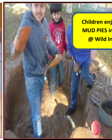
Children enjoyed making MUD PIES in the mud pit @ Wild Imagination