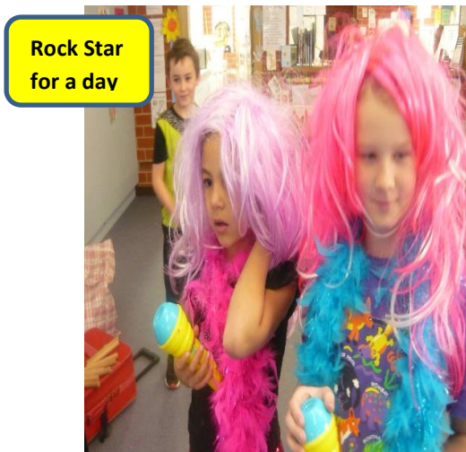
Rock Star for a day